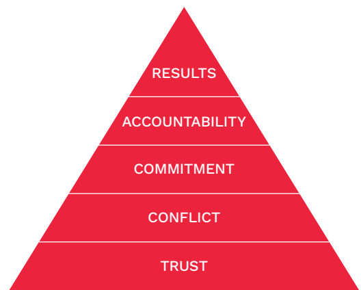
The Five Behaviors Model

The experience is completed through a half-day training session, led by a trained Five Behaviors expert. This session includes a walkthrough of the Personal Development profile, breakout activities, and group discussion.